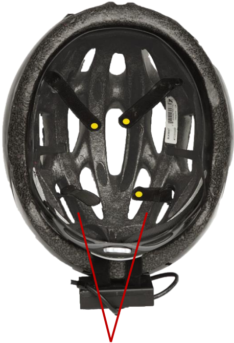
Insert straps through helmet.