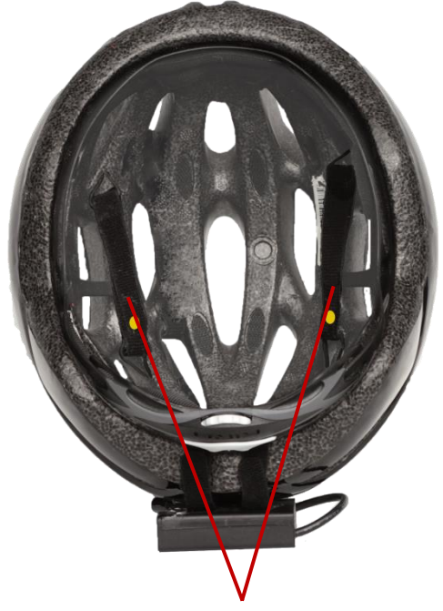
Close straps to secure LEDs.